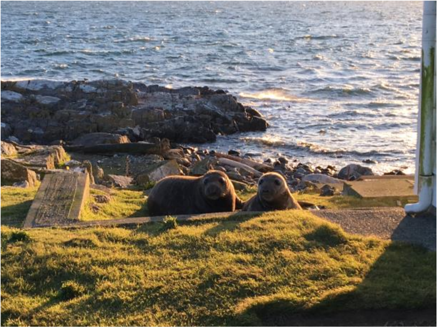
February 26, 2019 - Sea Lions at Race Rocks Ecological Reserve